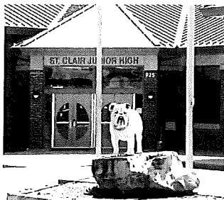
School Transportation Safety!

The City, MODOT, Franklin County, and the RXIII School District are working together in a joint effort to make necessary improvements to the intersections of Highway 30 at Bardot and High School Drive. This project is also scheduled to kick off and be completed in 2012.